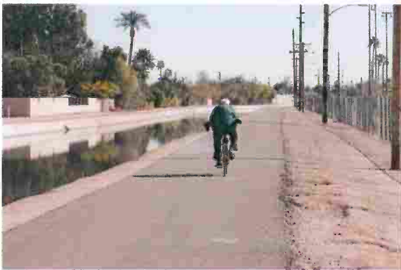
SRP Peoria bike and walking path

7. Next Meeting: Wed. January 27, 2016, at 1:30 p.m.