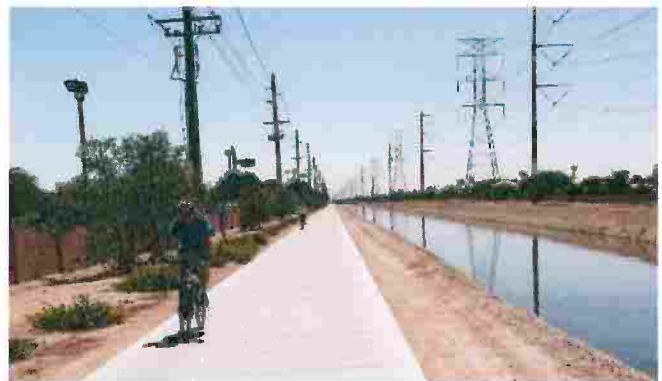
Western SRP canal path